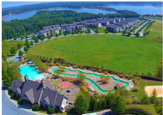
7 Month and one year leases also available!!