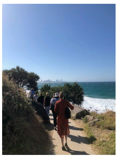
2023 Bond University Staff - On Country Experience