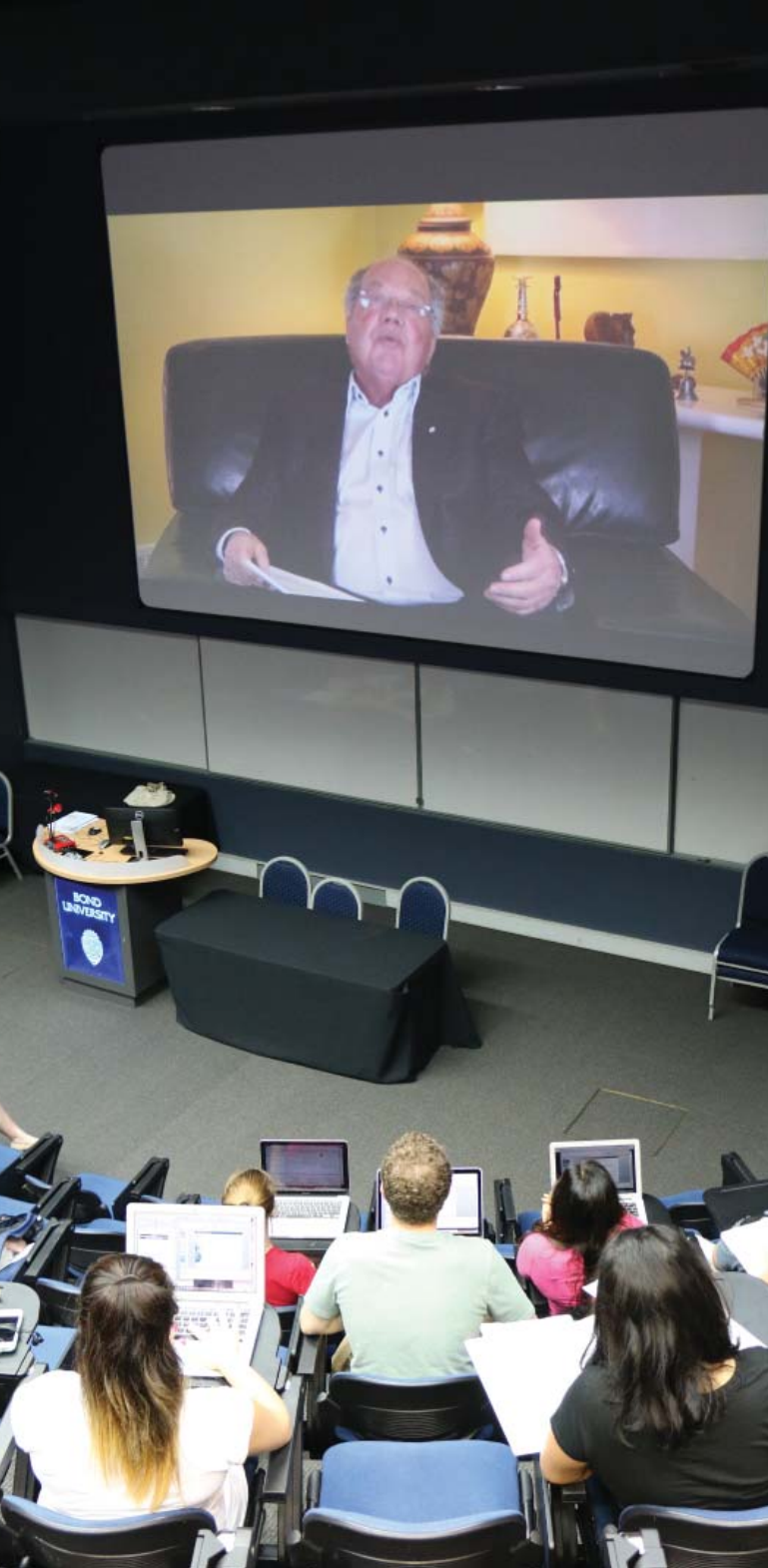
A video interview with the honorable Michel Bastarache, played during a Canadian Law lecture